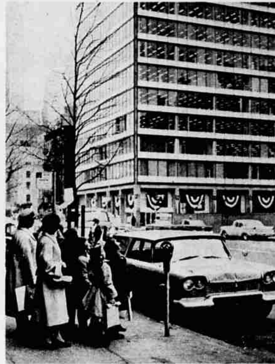
Scouts wave farewell to their sparkling building.