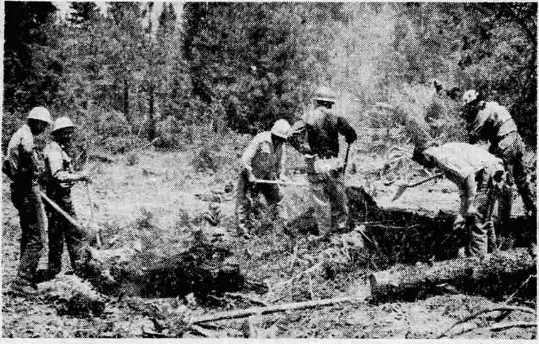
MOPPING UP —A group of trainees during the recent fire school in the Rogue River National forest clear brush from the ground and pile dirt on the source of a fire. Small fire suppression was included in the basic training at the school. Upon completion of training the men were assigned to stations for the summer.