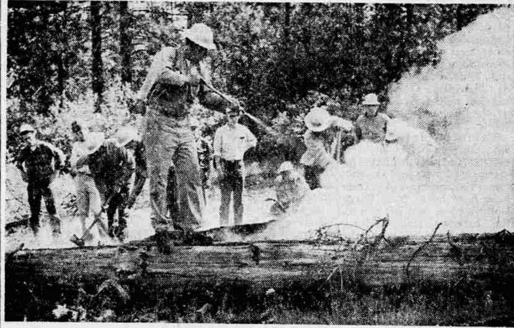
FIGHT FIRE —A back pump is demonstrated during the recent fire school sponsored by the Rogue River National forest officials. One man sprays water on a small blaze while members of the school clear the ground with axes and shovels. Seventy fire control personnel attended the 1958 Guard training camp.