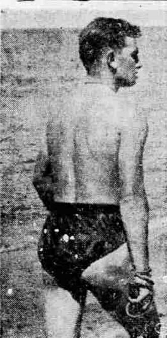
GUNPACKING British officer is ready for terrorist attack even at quiet swim on turbulent island of Cyprus.

Primitive man invented the mosaic when he arranged pebbles on the floor of his cave, says the National Geographic Society. Ancient Sumerians expanded the technique, cementing bright stones to a base. By 1,000 B.C., Egyptians were fashioning mosaics in the form of glass jewelry.