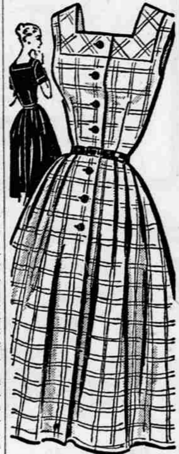
9205 SIZES 12-20; 40 by Marian Martin

Smartly spanning the seasons is this step-in dress. Ideal for plaid or checked cottons, with a year-round choice of 3 sleeve versions in our Printed Pattern. Simple yoked bodice, graceful skirt—so becoming. So cool. Printed Pattern 9205: Misses' Sizes 12, 14, 16, 18, 20; 40. Size 16 takes 5 1/4 yards 35-inch. Printed directions on each pattern part. Easier, accurate. Send Fifty Cents (coins) for this pattern—add 5 cents for each pattern for 1st-class mailing. Send to Marian Martin, care of Medford Mail Tribune, Pattern Dept., 232 West 18th St., New York 11, N. Y. Print plainly NAME, ADDRESS with SIZE and STYLE NUMBER.