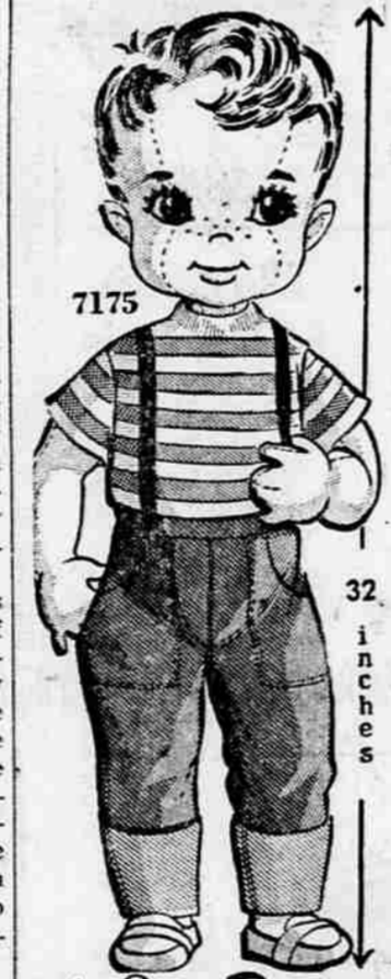
7175 by Alice Brooks

Boy's size-2 clothes fit this doll, that is 32 inches high. You will find him fun to make. A playmate for a lucky child—and the hit of the bazaar, too! Pattern 7175: Pattern for doll only. Use flesh-colored fabric for body, straw yarn for hair. Send Thirty-five cents (coins) for this pattern—add 5 cents for each pattern for 1st-class mailing. Send to Medford Mail Tribune, Household Arts Dept., P. O. Box 168, Old Chelsea Station, New York 11, N. Y. Print plainly NAME, ADDRESS, PATTERN NUMBER. Send Twenty-five cents more for a copy of our Alice Brooks Needlecraft Catalogue. Two complete patterns are printed right in the book... plus a variety of designs that you will want to order: crochet, knitting, embroidery, huck weaving, quilts, toys, dolls.