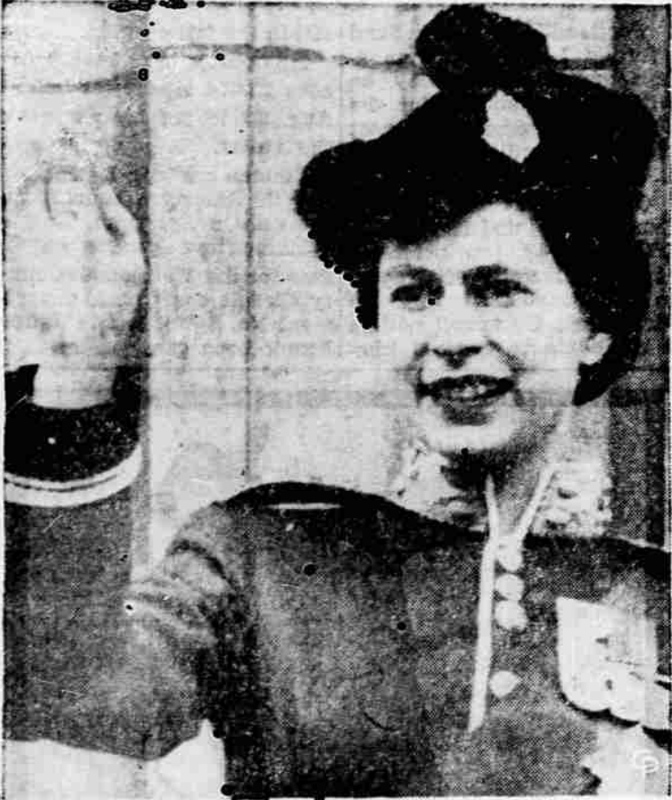
WAVING FROM BALCONY of Buckingham Palace is Queen Elizabeth at "trooping of the colors," on her birthday celebrated by millions.