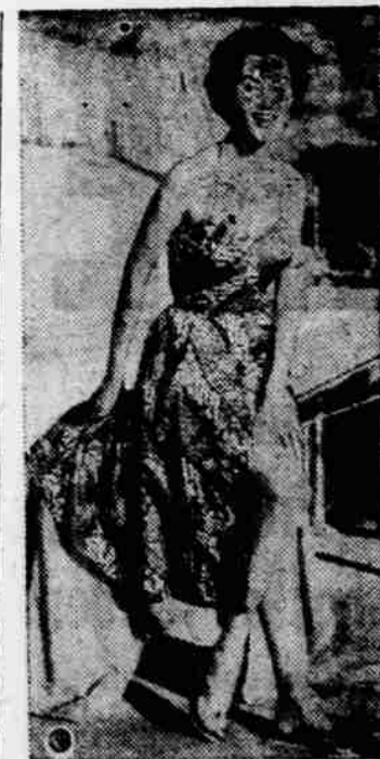
An exotic, many-colored Oriental print was used in this swimsuit by Gantner. A matching skirt makes this the perfect cotton costume for poolside or patio.