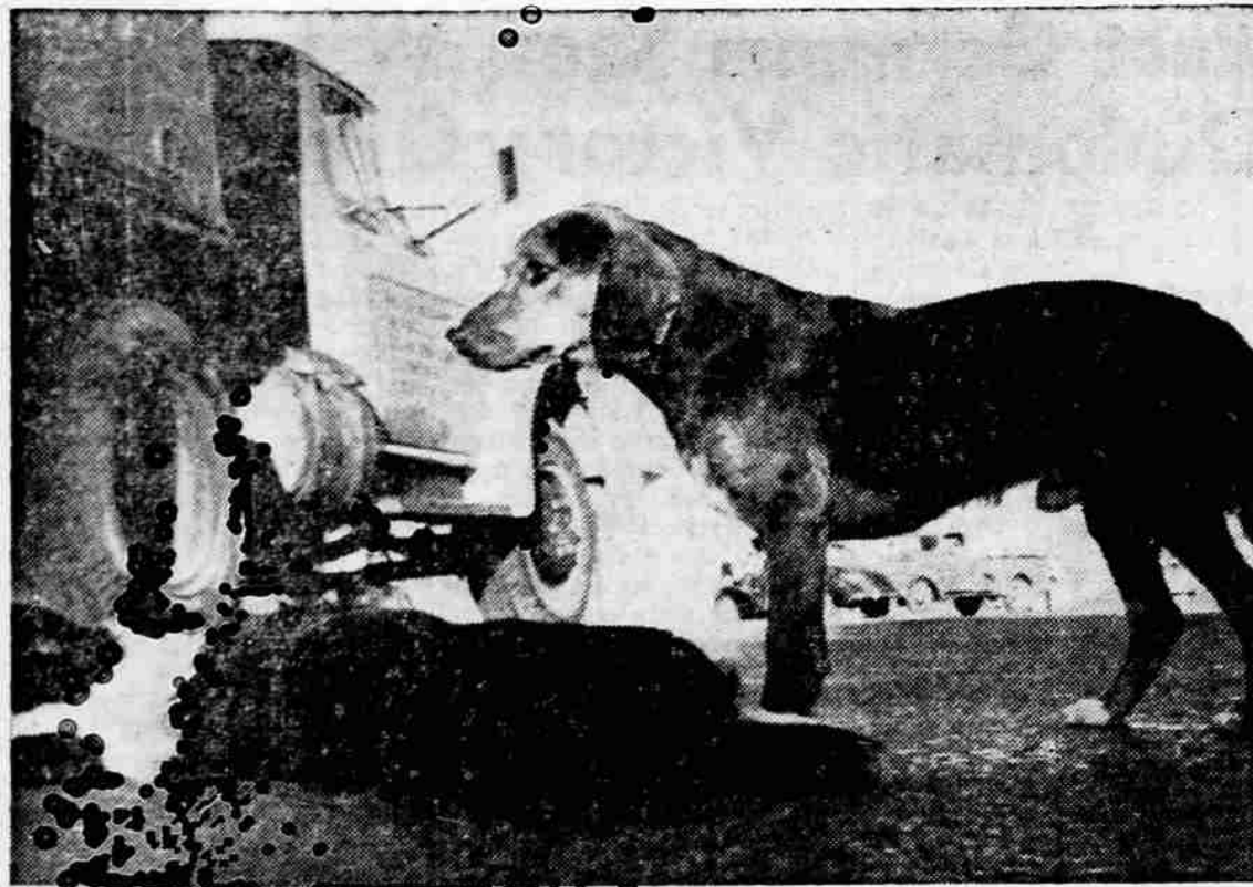
LONGER VIGIL —Keeping a dangerous and lonely vigil over the body of a friend who met death under the wheels of a truck, this dog stood guard as though waiting for aid in the early morning hours in the small Texas community of Weatherford.