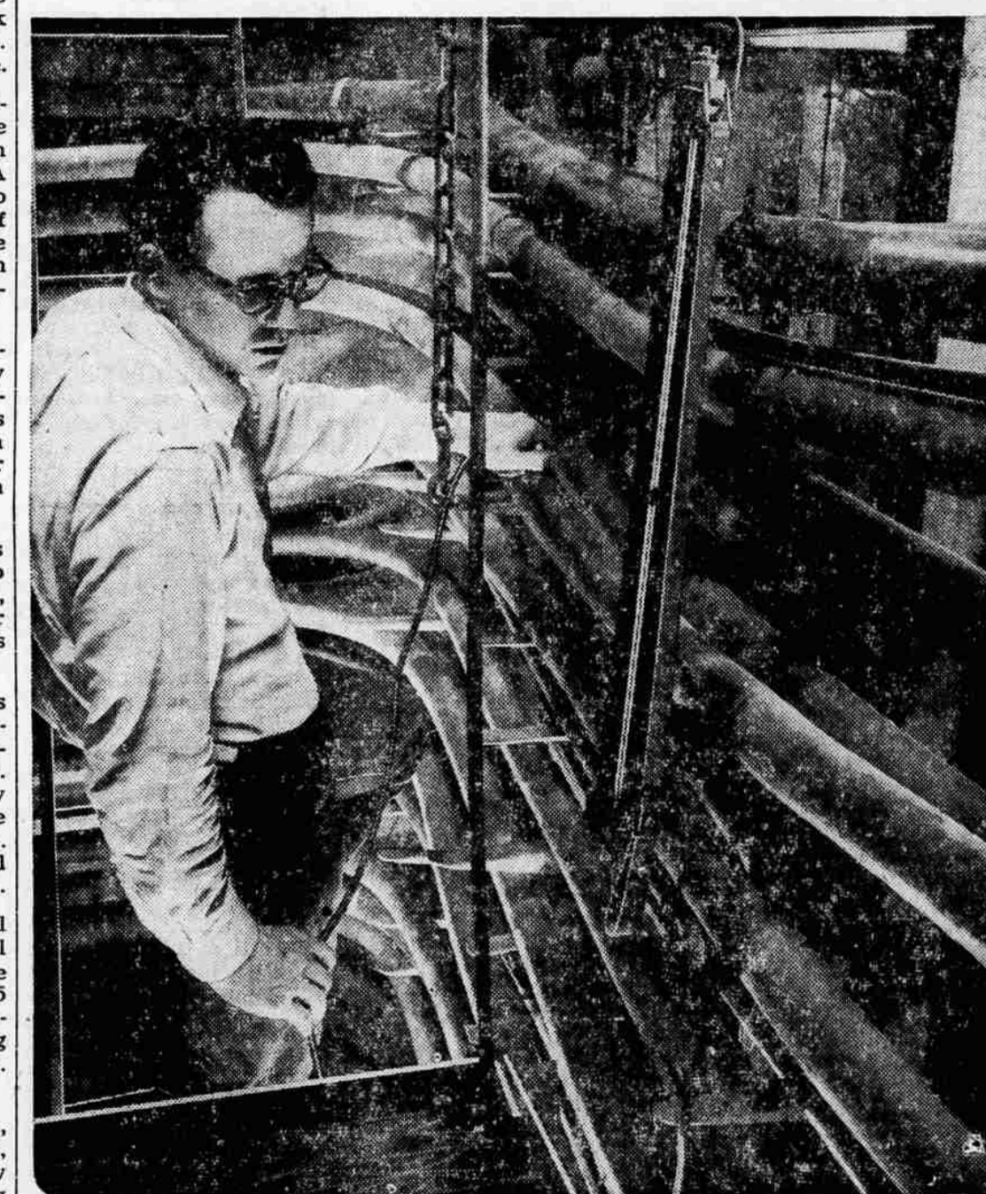
GUARDING VOICWAYS WITH AIR —how we pump telephone cables full of dry air to make phoning more reliable for you

WANTED OLD NEBULIZERS Asthmatics! We give $5 trade-in allowance for your old neb (even if broken) on a new Breatheset set—precision pyrex nebulizer; bottle of inhalant; zipper carrying case. Money-back guarantee. At Your Druggist