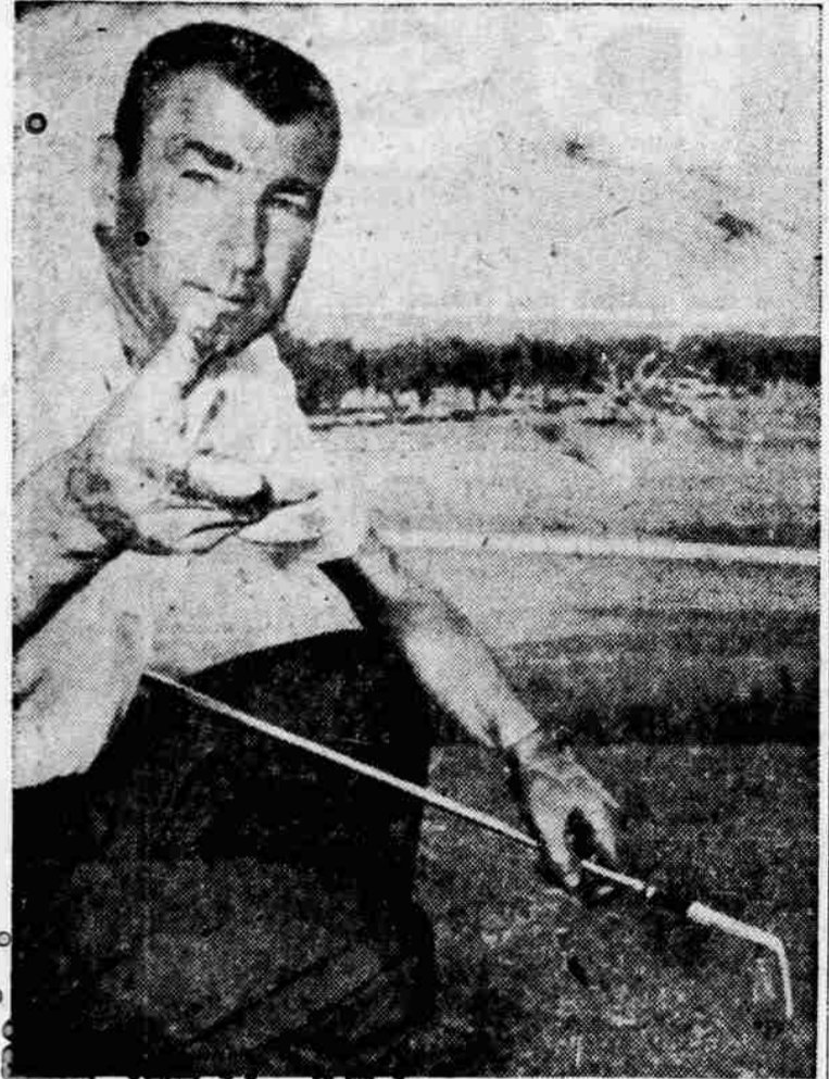
HOW THE WIND BLOWS —Former Open champ Ed Furgol throws a handful of grass in the air to check wind direction before starting a practice round at Southern Hills Country Club, Tulsa, Okla. All contestants in the 58th U. S. Open (starting 6/12) have expressed concern over the 15 to 20 mph winds that have swept the course during the past few days.