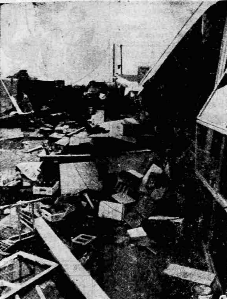
STRIKING INTO INDIANA , tornado smashes many buildings, including this store in New Castle. Provisionally, winds struck mostly in isolated areas.

Washington — (UPI) — Sen. Ralph E. Flanders (R-Vt.), proposed Thursday that Congress renew the administration's foreign trade program for only three years while a commission of economists takes a new look at trade policy. The House agreed Wednesday to a five-year extension by a 317 to 98 vote, thus giving President Eisenhower a legislative victory of surprising dimensions. The bill would allow the President to cut tariff rates an additional 25 per cent in negotiating trade agreements with other countries. Flanders is a member of the Senate Finance committee, which expects to start hearings soon on the House-approved measure. Astoria — (UPI) — Two reserve fleet LSTs are to be reactivated in the Commercial Ship Repair Co. yard at Winslow, Wash., the Navy has announced.