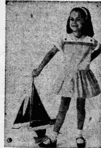
SEA MISS—In keeping with the new low-waisted look in mom's fashions is this nautical middy dress by Polly Flinders in Springmaid Everglaze cotton.