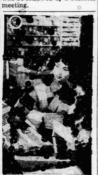
Wining attention in Japan are new designs in traditional cotton fabric for summer kimonos. Japan is one of nine foreign countries cooperating with Cotton Council International in a program to increase cotton consumption abroad.