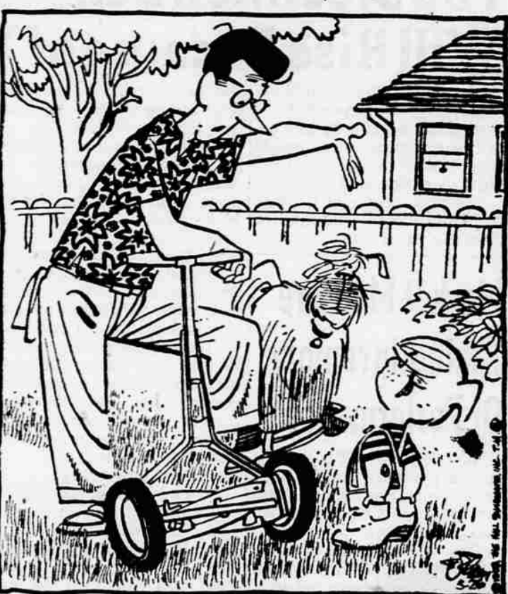
LOOK, SON, WE HAVE A LAWNMOWER, A CITY LOT, AND VERY CLOSE NEIGHBORS. AND, BESIDES, I WAS JUST KIDDING WHEN I SAID I WAS GOING TO BUY SOME SHEEP!