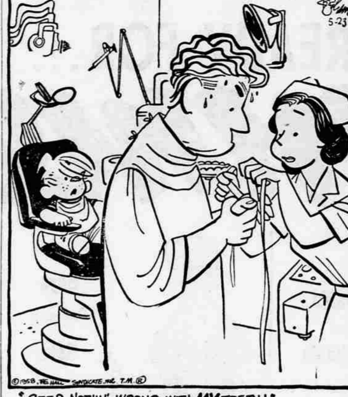
"SEE? NOTHIN' WRONG WITH MY TEETH!"