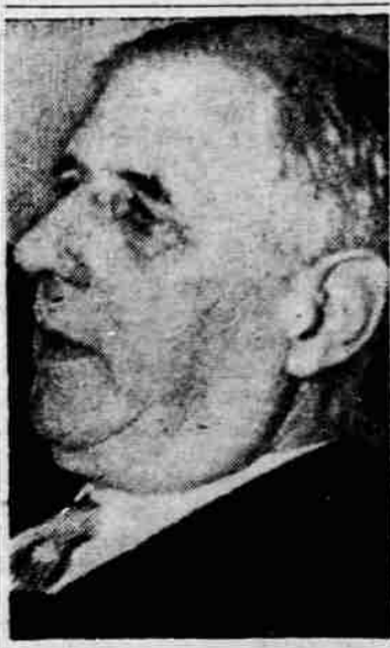
RETURNING to Paris headquarters, Gen. De Gaulle is grim in face of demands he assume control of French government.

Columbia River Packers Assn., Inc., Astoria, Ore.