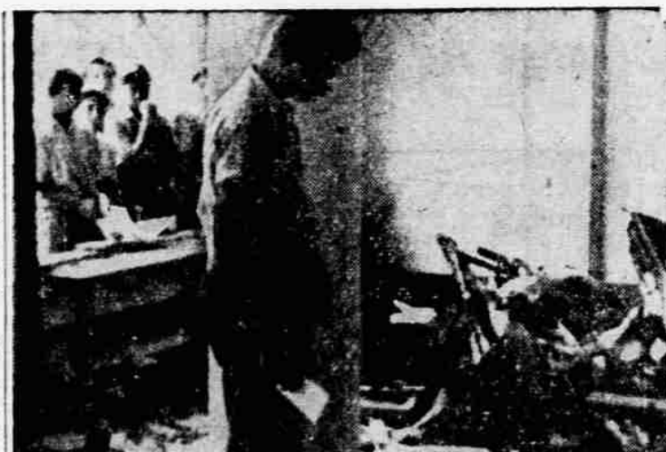
STANDING IN DEBRIS, employee of USIA Library in Tripoli, Lebanon, examines wreckage left by rioters calling for fall of pro-Western government.

Defense: Chairman Richard B. Russell (D-Ga.) of the Senate Armed Services Committee, said he believes Congress will work out a military reorganization bill "reasonably satisfactory to everybody."