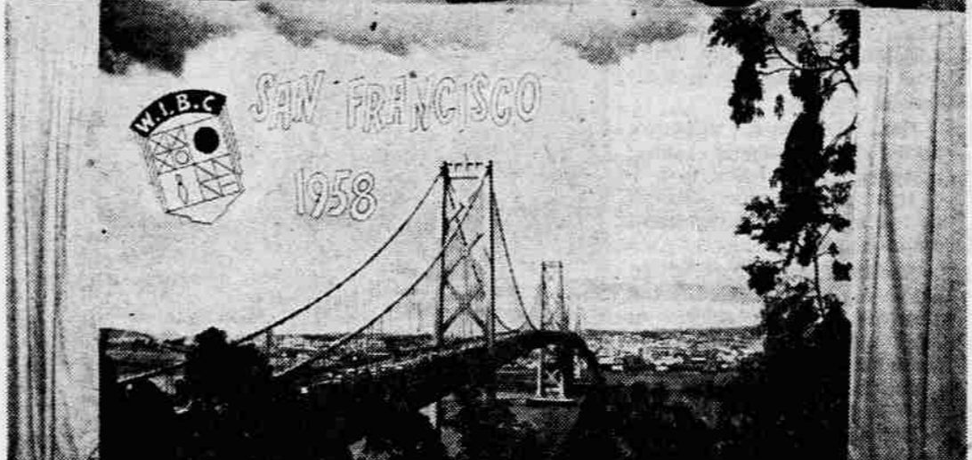
VIE IN NATIONAL TOURNEY —The bowlers shown here were among a number of teams from Medford which participated in the Women's International Bowling Congress tourney in progress at San Francisco. They represented Holiday Inn Motel in the tourney but have been under sponsorship of Skeeters and Skeeters Log-