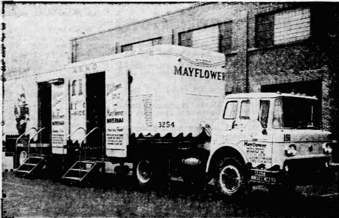
SPECIAL EXHIBIT —One of the features of the 1958 Medford Home Show is the Mayflower "Moverama," an exhibit of the most modern scientific developments in materials and methods for packing, shipping and storing all types of goods. The third annual Medford Home Show opens Thursday at the new National Guard Armory, and runs through, Sunday, May 18.