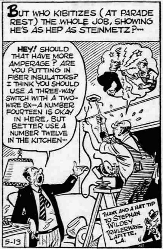
ANGLEWORM PLEADED NON COMPOS ABOUT ELECTRICITY--THAT'S HOW HE GOT PAL PLAYERS TO HELP HIM--