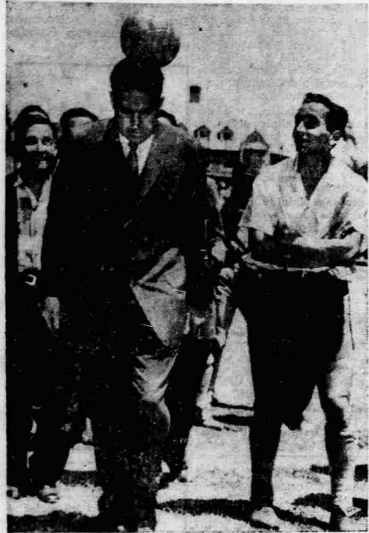
NIXON IN ECUADOR —Vice President Nixon, on a good-will tour of South America, tries butting a soccer ball during pregame ceremonies at stadium in Quito, Ecuador.