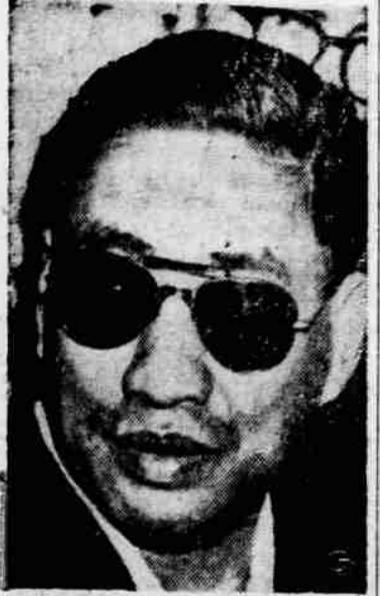
ENDING four-day search, Dr. Rodrigo Sarmiento submits to arrest in Brooklyn, N. Y., for knife slaying of Margaret Kabak, blonde nurse.

PRICE OF CAVIAR UP Moscow — The retail price of caviar has gone up 50 per cent in Russia. The price was boosted Tuesday from 130 rubles ($32.50 at the arbitrary official rate of exchange) per kilo (2.2 pounds) to 190 rubles ($47.50).