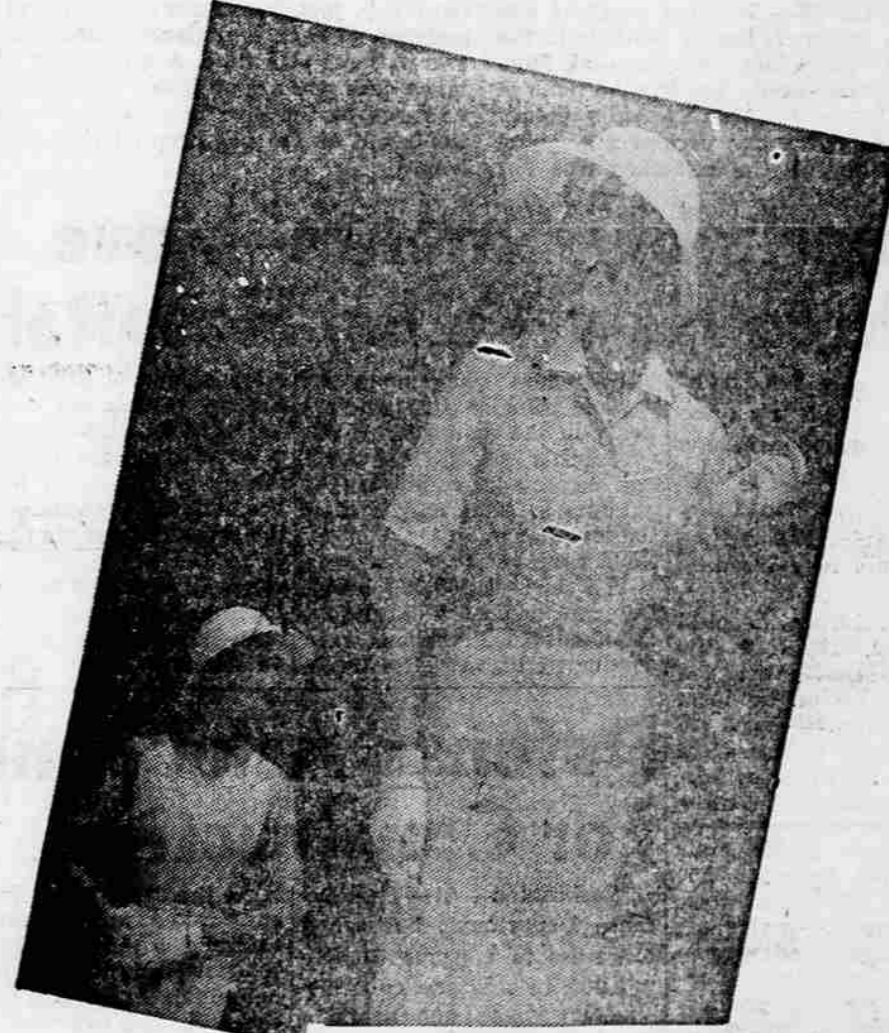
Take off the washable cotton and celanorm braid embroidered plaid bolero to show two different yet versatile looks. Smooth, smart and simple . . . a stunning sheath that knows no limits as to where it can be worn. Perfect for warmer climates. Pink, Blue, Black, Navy.