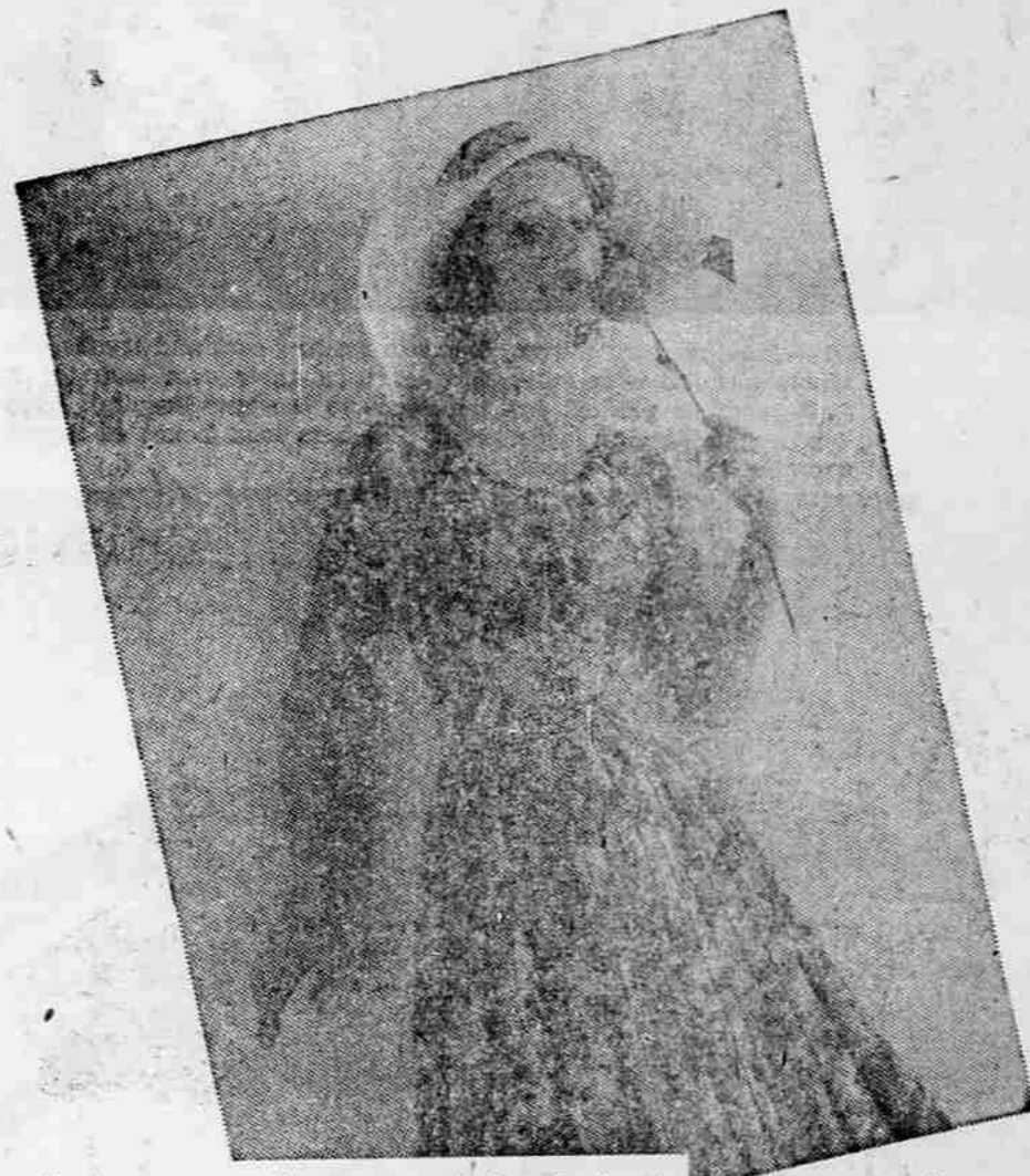
Portrait of a woman who wants to look refreshingly cool and lovely from now through summer. Forever Young's printed bemberg (®) is in a whirl of floral pattern. Crescent neck atop a slim waist atop a flare skirt . . . guaranteed to keep you fresh as a daisy. Green, Blue, Aqua.