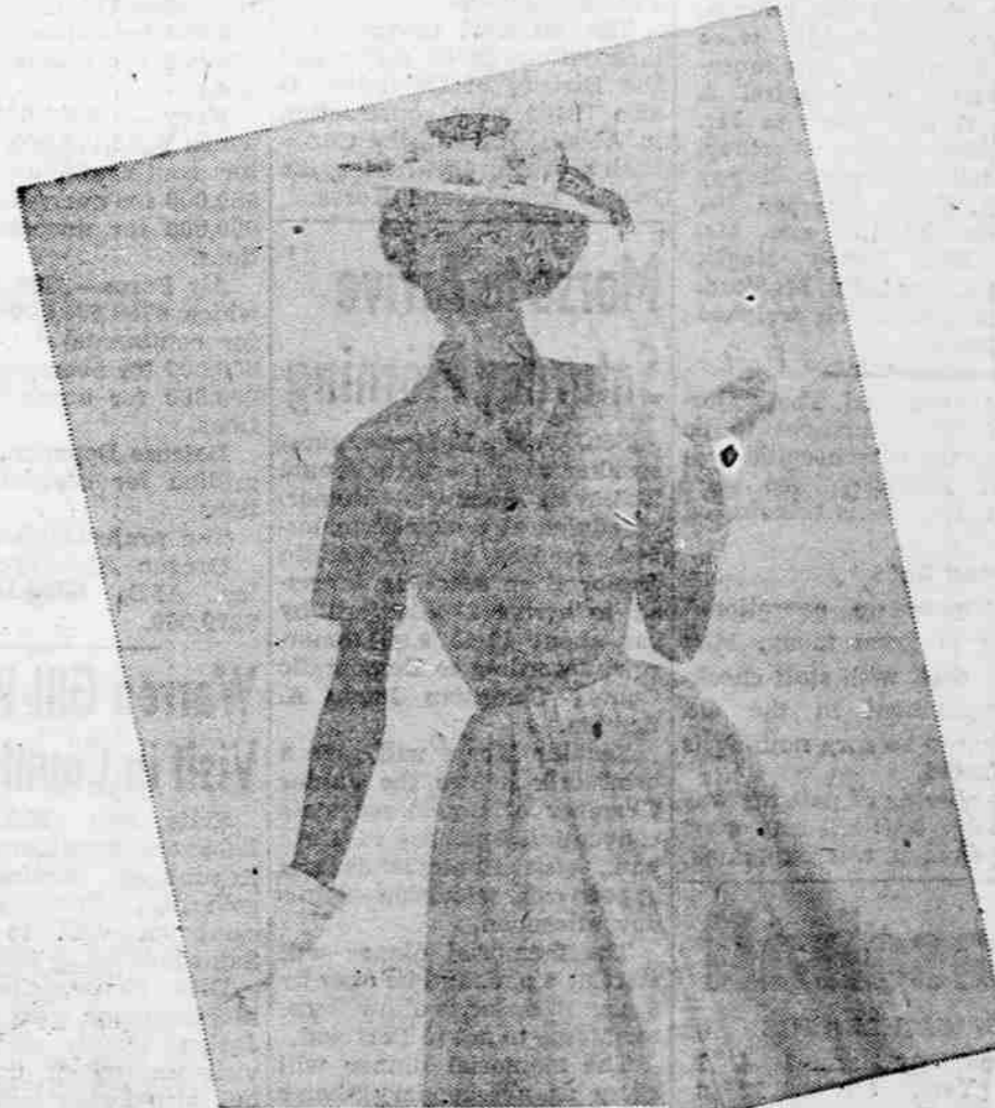
Sugar 'N Spice 'N everything nice is on a classic coat dress Schiffler eyelet embroidered bodice . . . delicate lace touches on collar and cuffs, washable dacron batiste washes in a wink, requires no ironing, perfect for travel. Flare skirt enhances the figure. Pink, Blue, Mint.