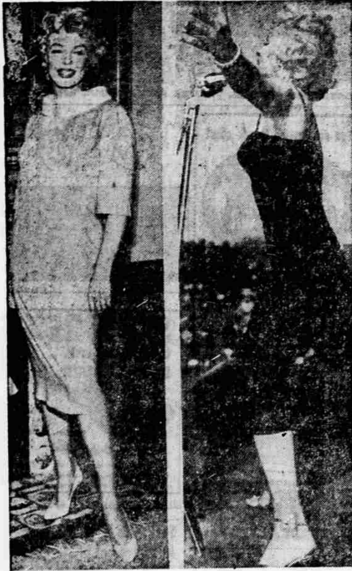
DARK DAYS ARE UPON US, MEN! —Marilyn Monroe has taken to the sack dress. Gone are the days when MM's famous curves could be seen and appreciated, as shown at right during her tour of Korea in 1954. Photo at left shows sack-clad Marilyn after she signed a contract to return to the screen after an absence of nearly two years. Sad, truly sad.