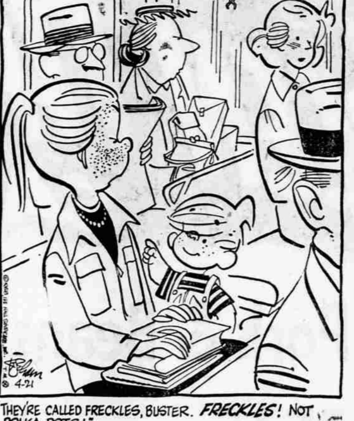
THEY'RE CALLED FRECKLES, BUSTER. FRECKLES! NOT POLKA DOTTS!