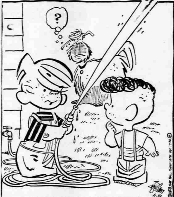
AND WHEN SOMEBODY IS WAY OFF, YOU TURN THE SNOZZLE LIKE THIS AND IT SHOOTS FARTHER, SEE?