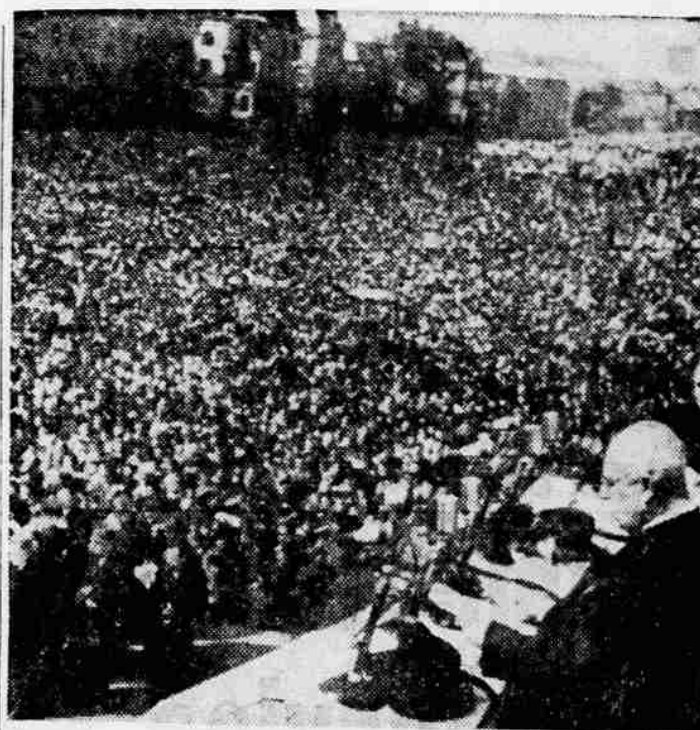
BUDAPEST ADDRESS —Soviet Premier Nikita Khrushchev addresses a huge crowd in Budapest, Hungary, as he helps mark the 13th anniversary of the liberating of the city from the Nazis by the Red Army. Khrushchev, on his first trip abroad since taking over the Kremlin reins, warned the Hungarian Communists that they should not expect Soviet military aid in the event of another "counter-revolution."

The Hudson river was given its name in 1674. Before that it had been named the San Antonio river and the Mauritius river.