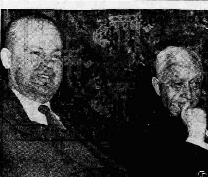
SITTING AT press conference in exclusive Union Club at Cleveland is Mikhail Mentshikov, Soviet ambassador to U. S., left. With him is Cyrus Eaton.

Jacksonville — Prospect won a Jackson County B league baseball game from Jacksonville high on Friday. The score was 24 to 23. A perfect hand in bridge—that is 13 cards of one suit—could happen only once in 40 billion hands.