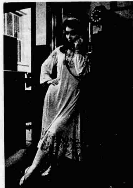
While thousands watch ballet come to life in theater, backstage a ballerina nonchalantly pauses to telephone friend.

first step to beautiful painted walls* *... Super Kem-Tone Latex paint dries with a velvet-flat finish that is guaranteed washable!