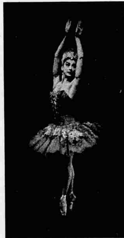
Star of stars, Margot Fonteyn, dressed for title role in "The Firebird," strikes graceful pose she must do to perfection when curtain rises and music begins.