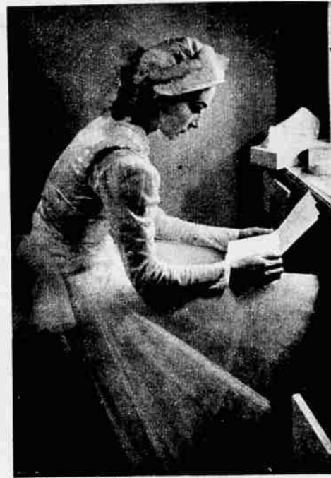
Unperturbed by pending appearance onstage, prettily costumed ballerina reads a letter from home.