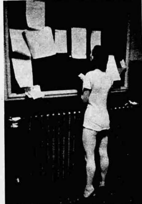
Another, still in practice clothes, stands on tiptoes to read notices of next day's cast, costume, and schedule.