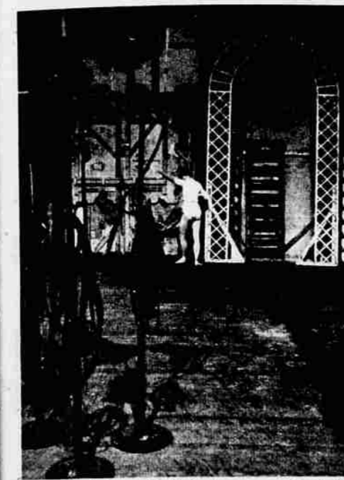
Backstage ballet, however, includes some necessary labor. Two hours before performance, star Nadia Nerina (left) limbers up on deserted stage, and (at right) Franklin White completes arduous make-up for role as wicked magician.

And the most enchanted audience of all is the cast itself. No matter how often they've seen it—or danced it—members can still stand open-mouthed in the wings, marveling as the never-never world of once-upon-a-time comes to life once more.