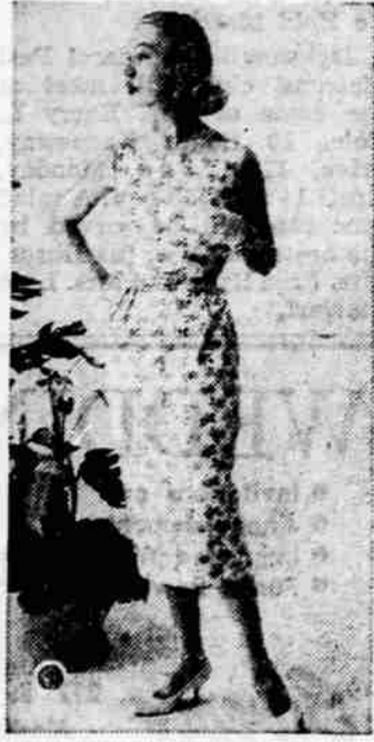
Cotton bags, a long-time source of home sewing fabrics for many American women, come in up-to-date patterns such as this pretty rose print. The double-duty containers are used for packaging feed, flour, and other staple products.