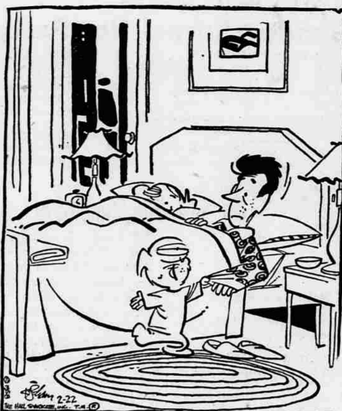
"HEY, COME OVER TO THE WINDOW AN' LISTEN TO THESE GUYS SING SWEET ADDA SOMETHIN'!"

This sort of fakery and double-talk will not