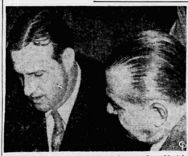
SETTING RECORD for National League, Stan Mustal (left) signs 1958 contract with St. Louis Cardinals for $100,000 salary. At right is A. A. Busch, owner.