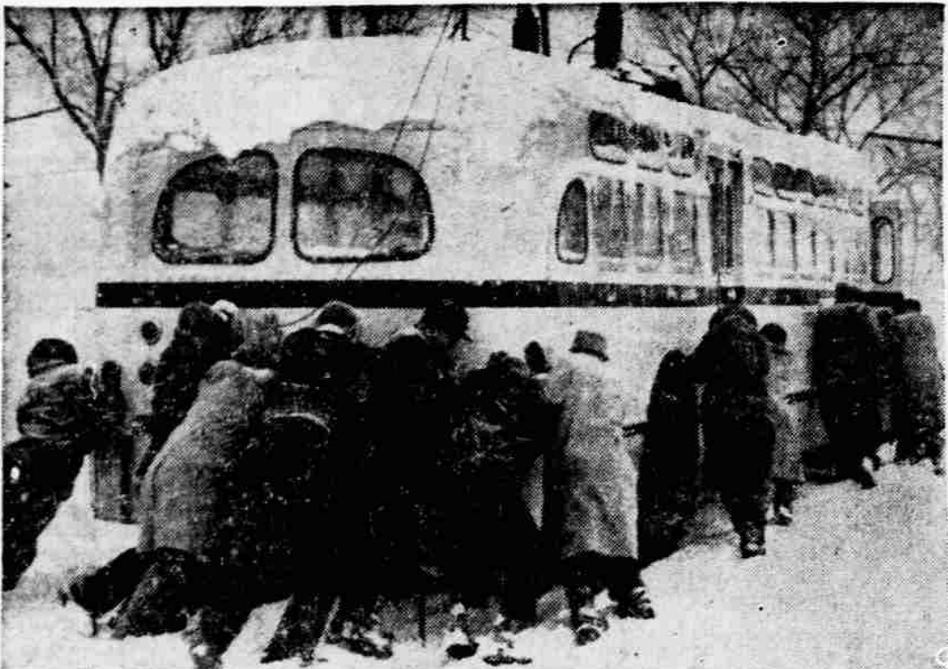
EVERYONE GETS IN ACT as passengers try to get trolley bus started in 13-inch snowstorm which covered Kansas City, Mo. Three deaths were reported.