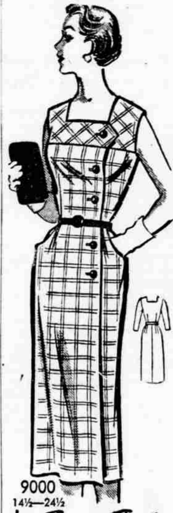
9000 14 1/2-24 1/2 by Marian Martin

Gem of a Printed Pattern—You'll find this step-in dress fits the shorter, fuller figure beautifully—side-button sheath lines just melt the inches away. Make it for all spring occasions.