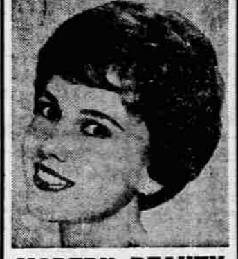
MODERN BEAUTY 131 S. Central Ph. SP 3-5379