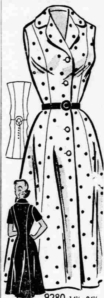
9280 14½-24½ by Marian Martin

Half-sizers! Welcome Spring in this shimmering, princess step-in — proportioned to fit and flatter the shorter, fuller figure. Easy to sew with our Printed Pattern — see diagram!