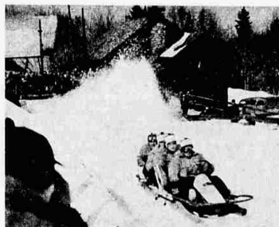
Combination of slick runners and even slicker curves makes bobsledding one of fastest sports.