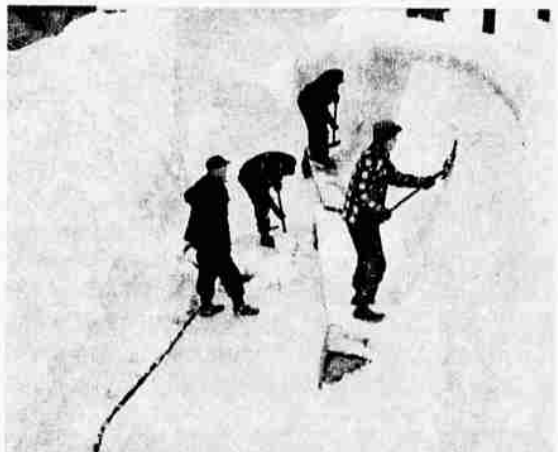
Bobruns must meet rigid specifications; crews spray walls daily, pack them thick with ice.