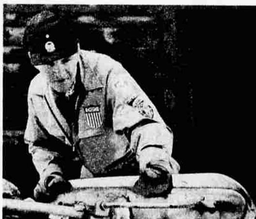
Sleds need regular maintenance, too. Here bobsledder slickens runners with emery cloth.