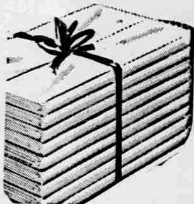
CASES 42 x 36..... 44c

FULL SIZE — 81x108 ..... 1.89 FITTED DOUBLE SIZE ..... 1.89 FITTED TWIN SIZE ..... 1.79