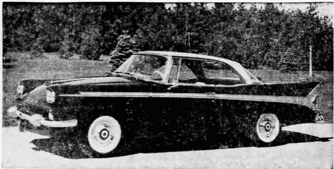
NEW IN EXPANDED LINE — The new Packard two-door hardtop (above) is the latest addition to the line of 1958 Packards. The new models are designed in the classic Packard tradition and feature a forward-

sloping hood. Standard equipment items include power brakes, finned-drum brakes and flightomatic automatic transmission. The car can be seen locally at De Leigh Motors, 134 South Riverside ave.