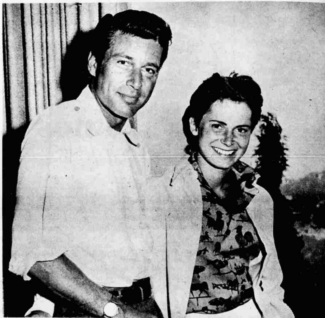
Efreim Zimbalist, Jr. and his wife are as surprised by his movie success as the experts.