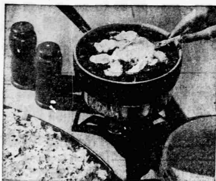
A rich Beef Stroganoff makes a wonderful party dish. Swirl in the sour cream at the table, just before serving.

Informal entertaining has been popularized by today's busy homemakers. A simple meal planned around an unusual main dish makes meal preparation easy. Buffet service allows the maidless hostess to enjoy the meal with her guests.