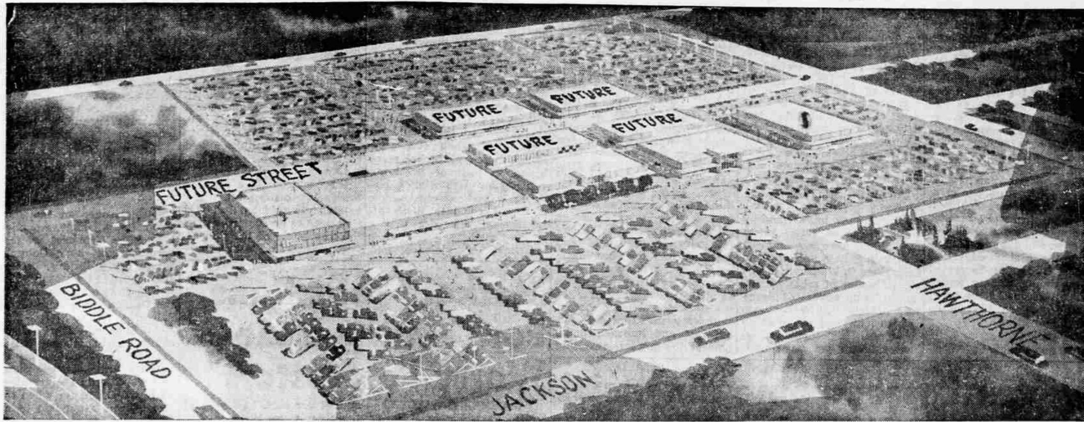
... Ground Leveling Starts for Shopping Center

Hearing due on O&C land restrictions... bronze plaques presented Chamber of Commerce past presidents... bill proposed to remove school bond complications... bus driver suffers heart attack... bank debits in area show 5 per cent increase... woman dies of burns suffered in attempt to light gas oven... 50,000 Shakespearean festival folders put into mail... Mrs. Elizabeth Myrtle Beck dies of heart attack on airplane following Hawaiian vacation... three Jackson county tavern owners arrested for displaying games of chance... Medford school board plans $1,200,000 bond issue... 2,665 unemployed during January... women killed in highway crash near Medford... Lone Pine residents plan meeting to fight annexation... Patricia Leek, Richard James win Youth Leadership awards... tavern owners fined for operating games of chance... National Guard to control