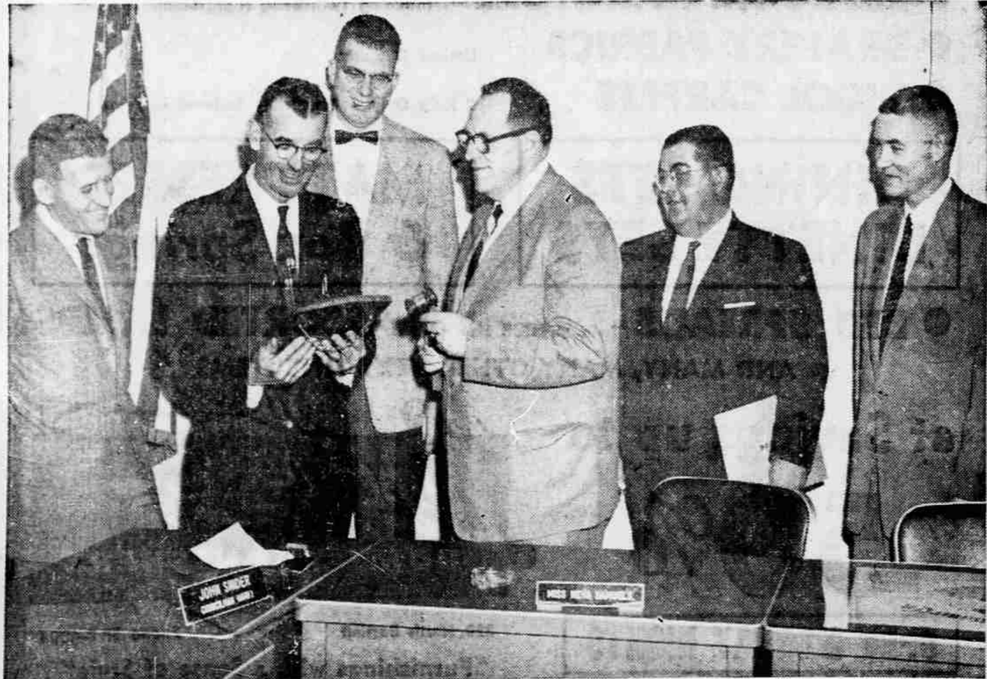
... New Medford Mayor, Councilmen Take Office