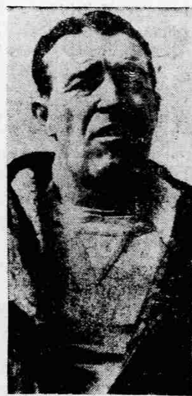
FRANK LEAHY To Sign Aggie Pact