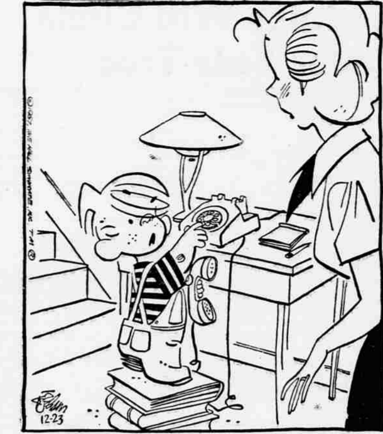
"I'M ORDERIN' A BALE OF HAY. DON'T YOU 'MEMBER? I'M GETTIN' A PONY THIS WEEK!"

Portland — A proposed withdrawal of 80 acres of public land in Oregon Grazing District No. 5 in Crook county for use by the Bureau of Land Management as a source of cinders for road material was announced today by Virgil T. Heath, Oregon State Supervisor for the bureau at Portland. The land is located about seven miles west of Prineville and is being used for grazing live-