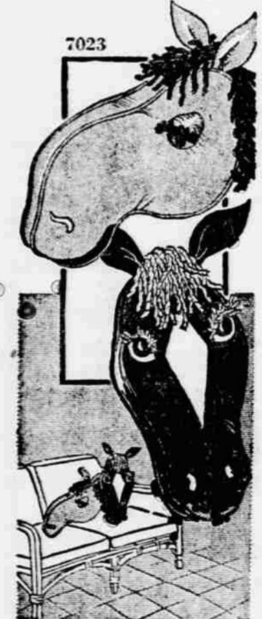
7023 by Alice Brooks

Horses right in your home! Scatter these colorful pillows in a bedroom or playroom. Young and old—all will love them! Pattern 7023: Transfer of 2 horsehead pillows 7x14 inches. Easy to make in felt or other fabric; made of rug cotton! Send Thirty-five Cents (coins) for this pattern—add 5 cents for each pattern for 1st-class mailing. Send to Medford Mail Tribune, Household Arts Dept., P.O. Box 168, Old Chelsea Station, New York 11, N.Y. Print plainly NAME, ADDRESS, PATTERN NUMBER. Send Twenty-five Cents more for a copy of our Alice Brooks Needlecraft Catalogue. Two complete patterns are printed right in the book... plus a variety of designs that you will want to order: crochet, knitting, embroidery, huck weaving, quilts, toys, dolls. The dragonfly is a creature of the air, never walking. Its legs are used only for catching prey and as landing and perching gear.