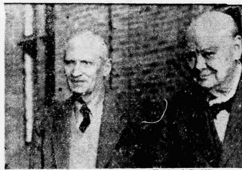
CELEBRATING AT WESTERHAM, England, Sir Winston Churchill plays host to a lone guest, Field Marshal Montgomery, left, on Churchill's eighty-third birthday. Members of the family also were present.