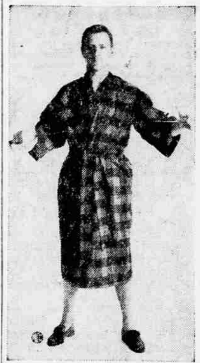
Tailored for comfort, this deep-toned checked cotton robe has wide sleeves, a roll collar, and a looped sash. The robe is an Alexander Shields fashion made up in M & W Thomas cotton.

ANOTHER GENERATION Wellsburg, W. Va. — A turtle, captured and marked here 24 years ago, has turned up again. The land-turtle was found on a nearby farm and has again been marked for another generation to find.