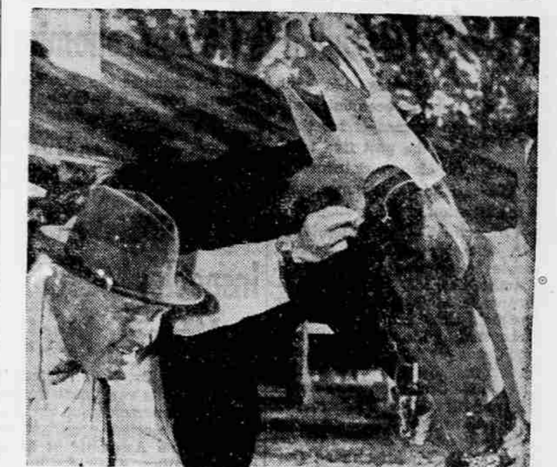
KING OF THE TURF—Trainer Sunny Jim Fitzsimmons puts a crown on the head of Wheatley Stable's Bold Ruler at Hialeah, Fla., after the 3-year-old colt was named "Horse of the Year."

Mexico has 28 states and three territories.