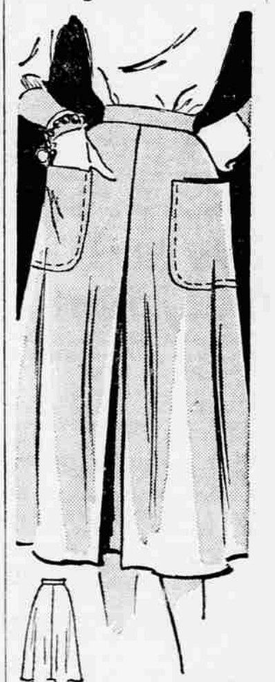
9157 WAIST 30"-46"