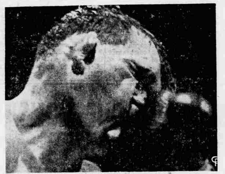
FLATTENED UNDER IMPACT of the smashing right hand of Neal Rivers is the face of Gene Fullmer, former middleweight champion, in their New York fight. Fullmer won the decision.

Time tested service assures best money service When you need up to $1500, bring your money problems to HFC, America's oldest and most experienced consumer finance company. You receive money service backed by 79 years' experience—prompt attention, a wide choice of repayment plans, and your money in one day. Visit or phone HFC today.