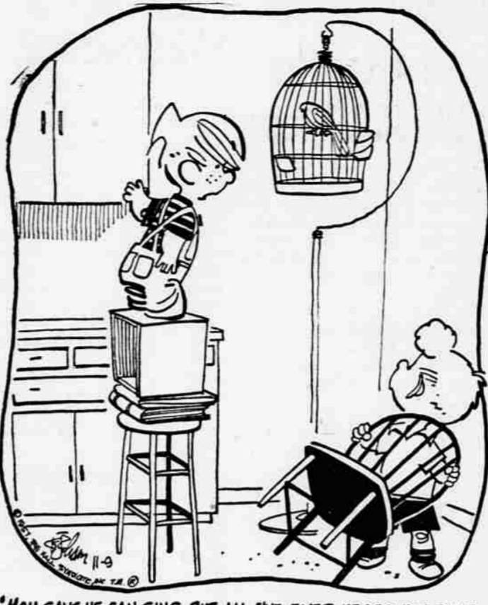
"MOM SAYS HE CAN SING, BUT ALL I'VE EVER HEARD HIM DO IS WHISTLE!"