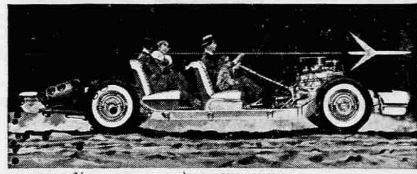
NEW-MATIC RIDE (A TRUE AIR SUSPENSION) TURNS ROUGH ROADS INTO HIGHWAYS OF SMOOTHNESS

Dual-Range Power Heater delivers the exact amount of heat or ventilation exactly when and when you want it. You push a button...power does the work!