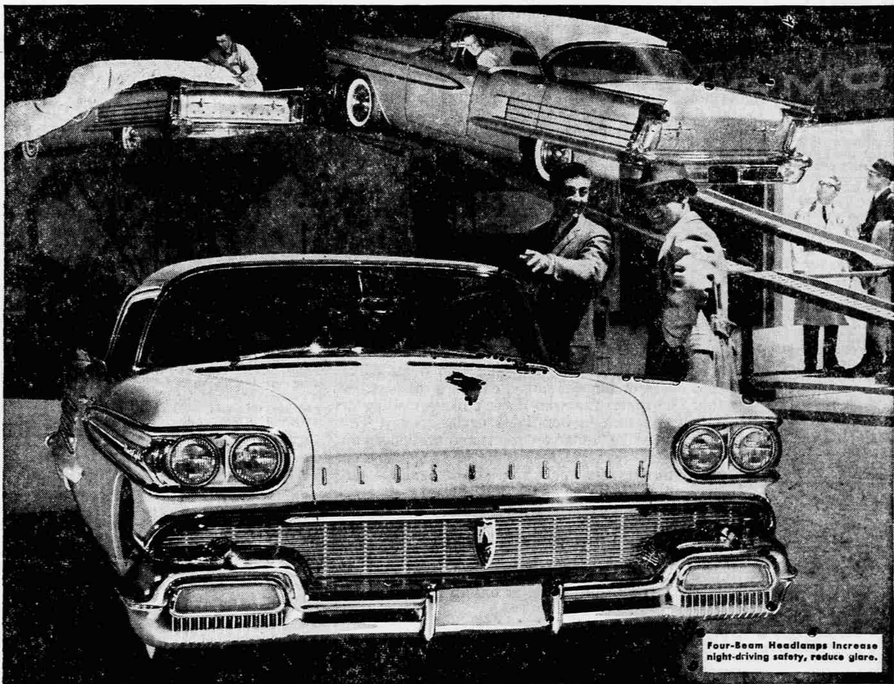
Four-Beam Headlamps increase night-driving safety, reduce glare.

...THE NEW WAY OF GOING PLACES IN THE ROCKET AGE!