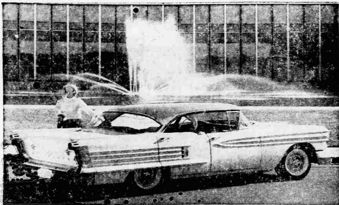
DISTINCTIVE STYLING — The Oldsmobile for 1958, which will go on display at the Darrell Miller company, 415 South Riverside ave., Medford, Friday, Nov. 8, offers a completely restyled body. Three Rocket engines with improved economy are offered in new models, which have smoother Jetaway Hydraulic transmissions and New-Matic ride, a new concept of air suspension. Oldsmobile's styling includes twin blades which sweep down the rear bumper crown.