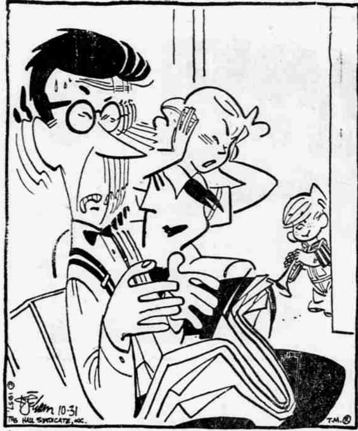
MEMBER WHEN ALL I COULD GET OUT OF THIS THING WAS A PEEP?

However, there is one consolation, as we see it. Those nations that do go back to Machiavelli as modern history indicates, have in their policies the seeds of their own ultimate destruction. — R.W.R.