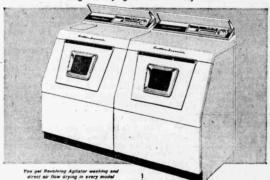
You get Revolving Agitator washing and direct air flow drying in every model!

with new STYLE-LITE Control Centers to assure perfect washing and drying results for every fabric