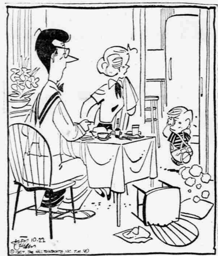
"I TOLD HIM TABASCO SAUCE WAS HOT!"

HE maintains that Russia's "Sputnik" victory was principally due to the superiority of Russian education, particularly in the field of science.