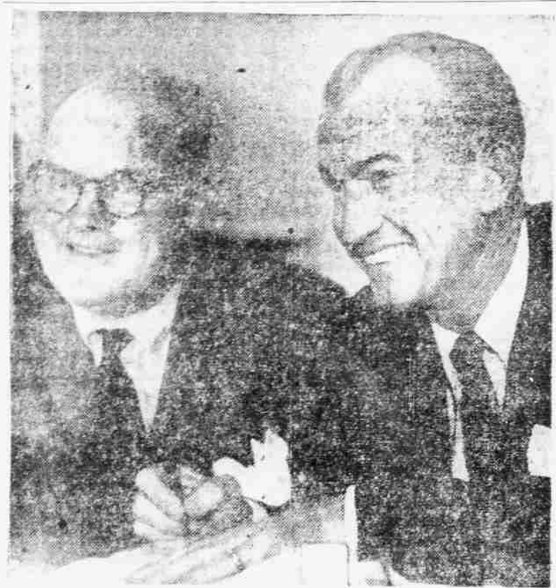
GIANTS SIGN RIGNEY —Bill Rigney (right) flashes a big smile as he signs a contract in San Francisco to manage the San Francisco Giants baseball club for two years. At left is Horace Stoneham, president of the club.

The top average of course was compiled by the 36-year-old Musial, who won his seventh N.L. batting championship with a .351 mark. Other 300-plus hitters were Mays, .333; Aaron and Robinson, .322 each, and Schoendienst, .309. Mathews hit .292, Banks 285 and Bailey 261.