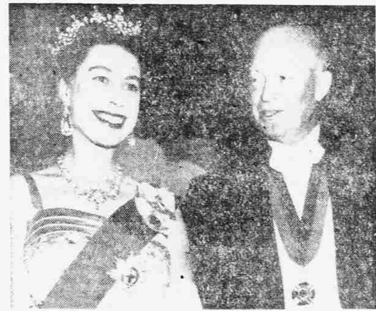
FORMAL AFFAIR —President Eisenhower is shown with Queen Elizabeth II at a dinner given by the Eisenhowers for the Queen and her husband, Prince Philip, at the White House. Ike is wearing the Order of Merit presented to him by the Queen's father. The Queen is wearing a diamond tiara given to Queen Alexandra in 1888 and worn by the current Queen when she opened Parliament in New Zealand in 1953.

A swallow-proof pin for baby diapers was patented in 1956.